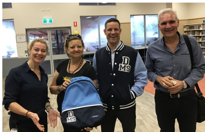
Board Members trying out the new DMS Varsity Jacket and Crumpler school bag, now available for purchase at the Administration Office